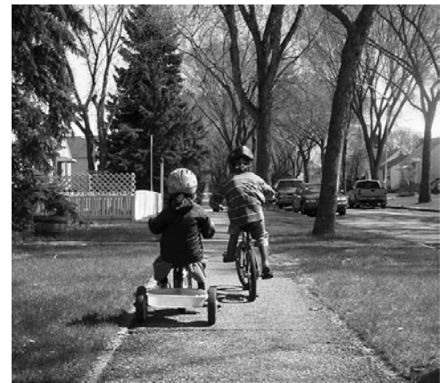
Rewing up the bikes