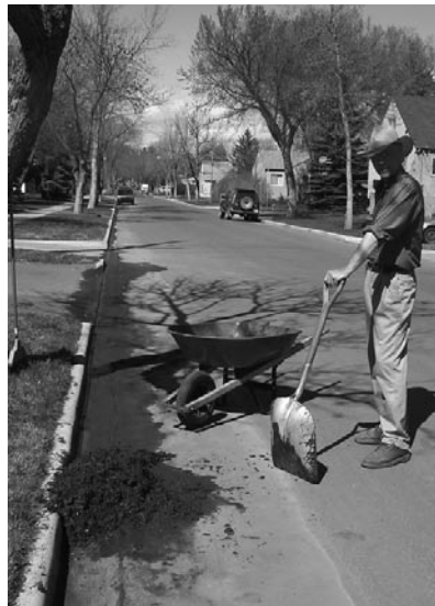
Why wait for the street sweepers?

September 4: League AGM for 2007-2008 year.