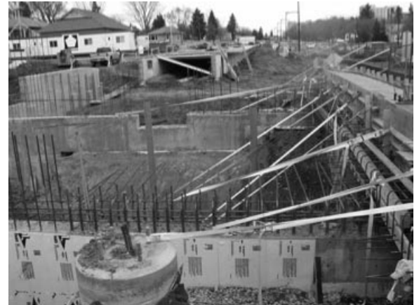
A real LRT station for McKernan/ Belgravia by the end of 2008?

Detailed info is available at www.edmontonslrt.com