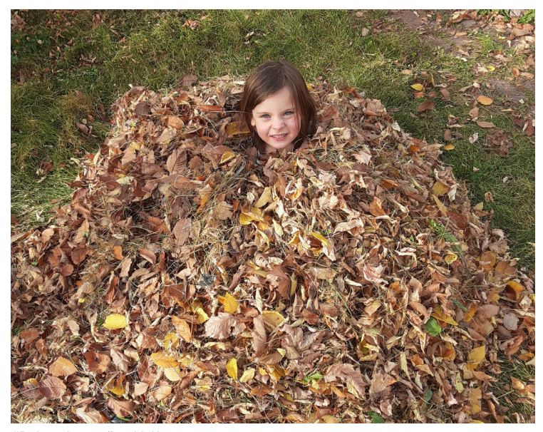
"Raking leaves" in McKernan