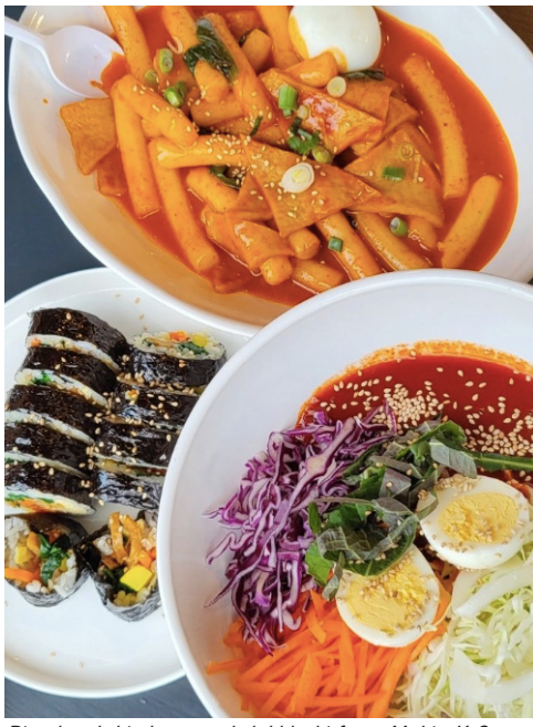
Rice bowl, kimbap, and dukkboki from Mukja K-Street Food

familiar chew of the batter. Once out of the fryer they are squirted with all manner of sweet and tangy sauces: chili mayo, honey mustard, and ketchup, among others. Maybe don't wear a white shirt, unless you also have a bib.