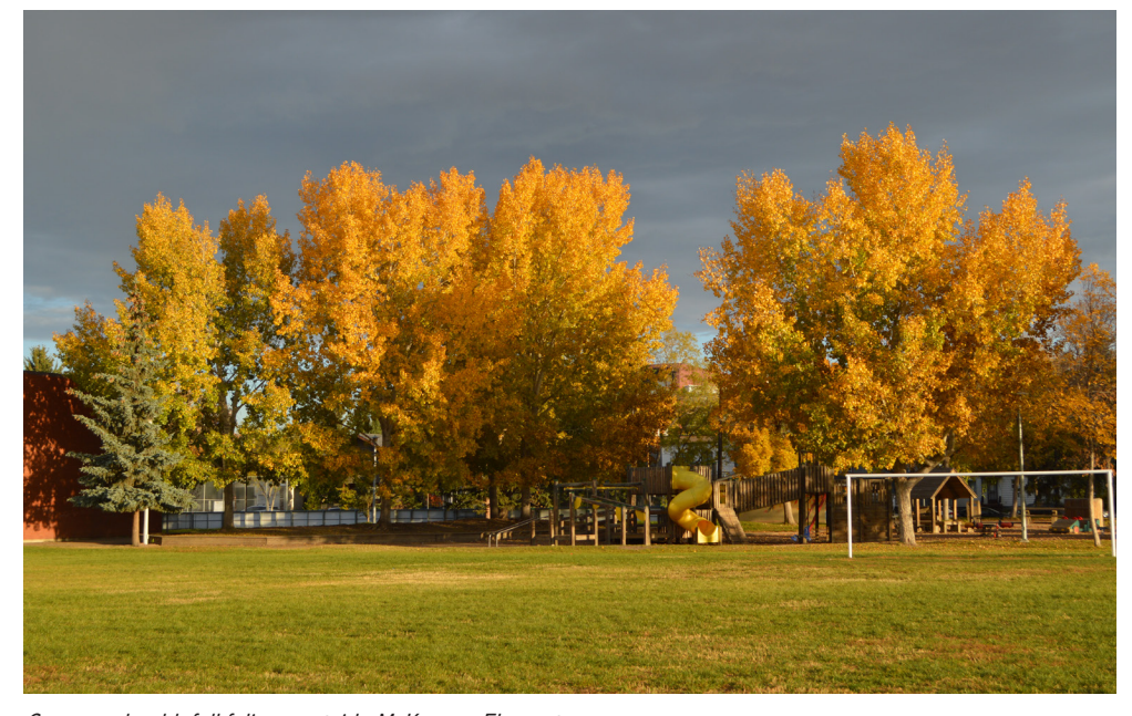
Green and gold: fall foliage outside McKernan Elementary