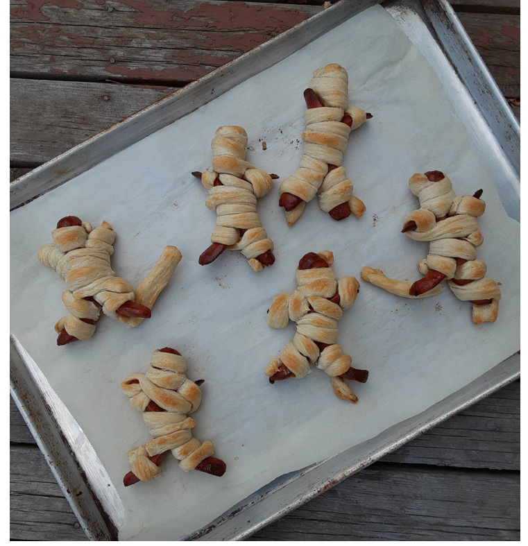
"Hot dog mummies" - a fun supper or snack on Halloween.