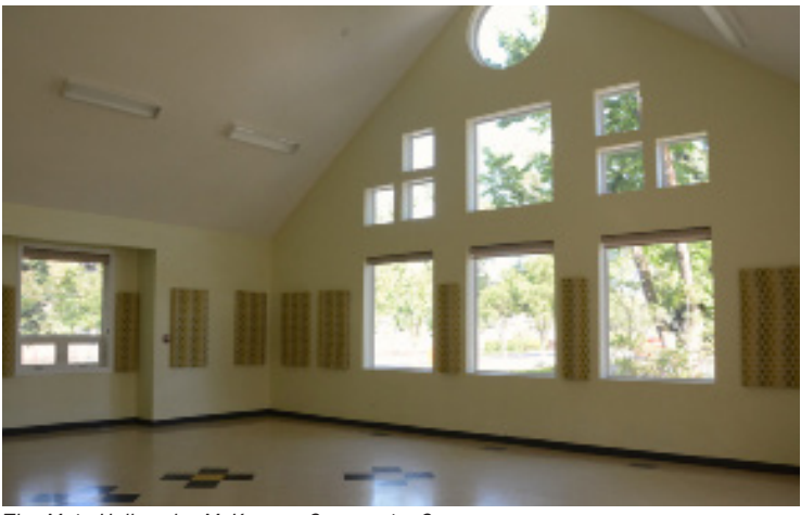
The Main Hall at the McKernan Community Centre

Residents of McKernan who are members of the community league receive a 15% discount on one-time hall rentals. GST will also be charged on rentals. Damage deposit will also be required, and renters must obtain their own event insurance.