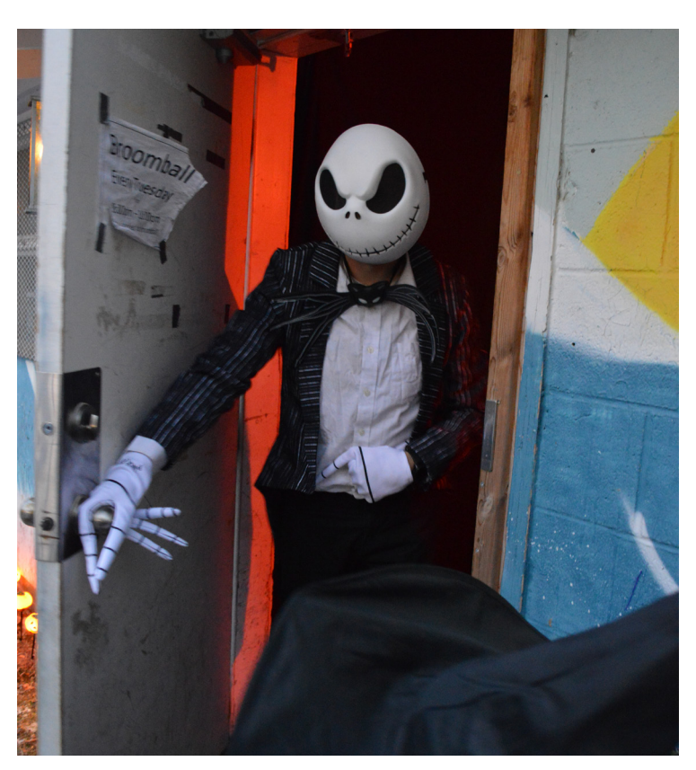
This ghastly (but dapper) skeleton greeted guests of the Haunted Shack