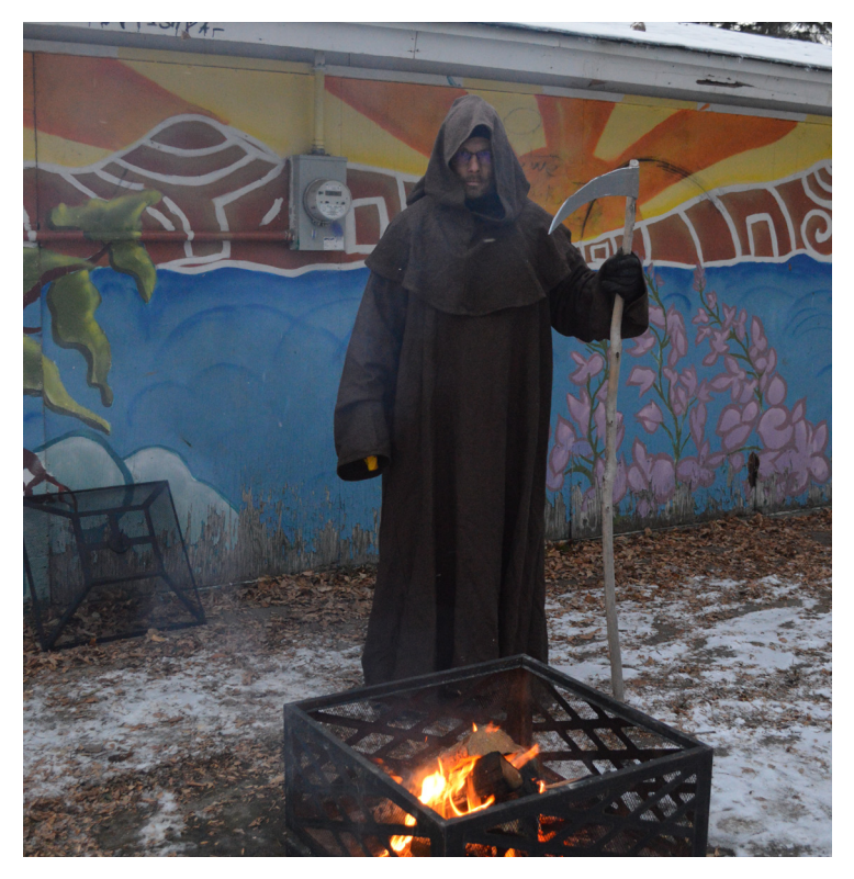
The Grim Reaper himself tended the bonfire outside the Haunted Shack

Some of the characters that were lurking about the McKernan Haunted Shack the evening of October 28, 2023.