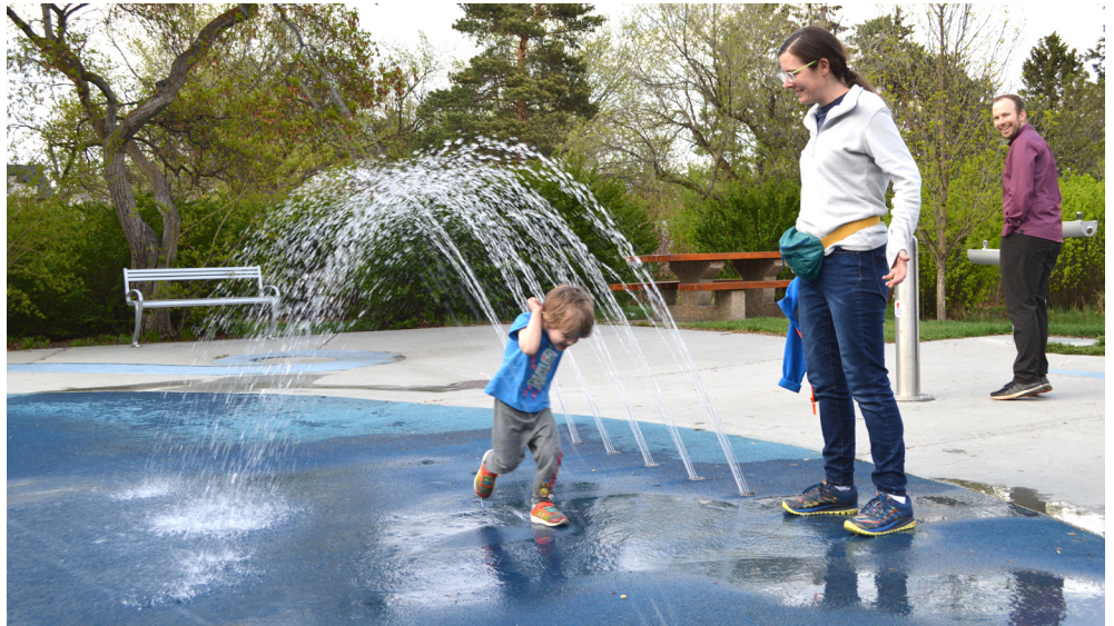
Braving the 'spray tunnel' at the McKernan Spray Park. The McKernan Spray Park opened on May 10. The city is hoping to have all spray parks open by the May long weekend.