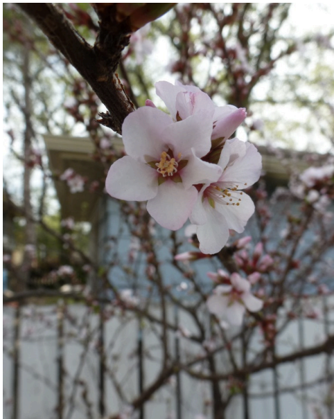
Nanking cherry blossoms in a McKernan yard.

One of the loveliest parts of May in McKernan is the generous sour cherry blossoms blooming throughout the neighbourhood. My two favourites are the Nanking cherries in the Pocket Park. The scientific name of Nanking cherry is Prunus tomentosa . "Prunus" means plum (think: prune), and "tomentosa" means densely hairy, referring in this case to the underside of the leaves. Nanking cherry is native to the far east, hailing from places like the Himalayas, China, and Japan. "Nanking" is the old roman-alphabet word for the Chinese city now more commonly transliterated as Nanjing.