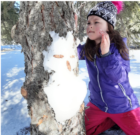
Snow sculpting in McKernan Park

Winter Waste Collection Schedule. A reminder that the city is now running its winter waste collection schedule