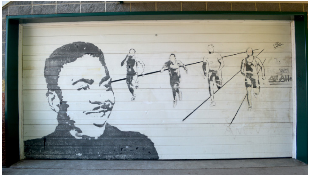
The mural on the north end of the Rollie Miles Athletic Park bleachers.