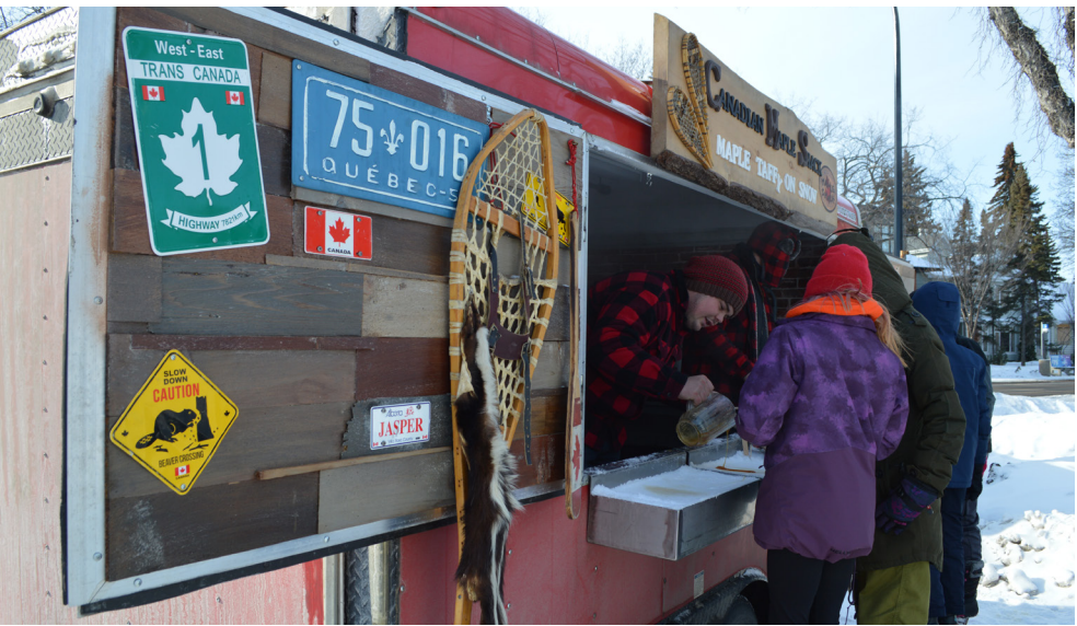
Making tire de neige (maple taffy) outside McKernan School. The Canadian Maple Shack gave students a taste of this traditional sweet during the school's celebration of National Francophone Week.