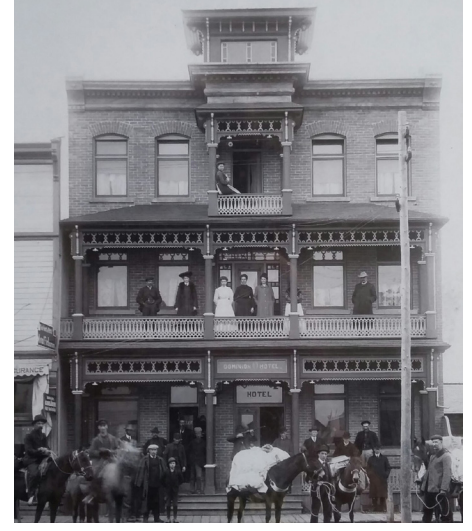
The Dominion Hotel, c. 1900.

Patient centered - Evidence based - Environmentally Responsible