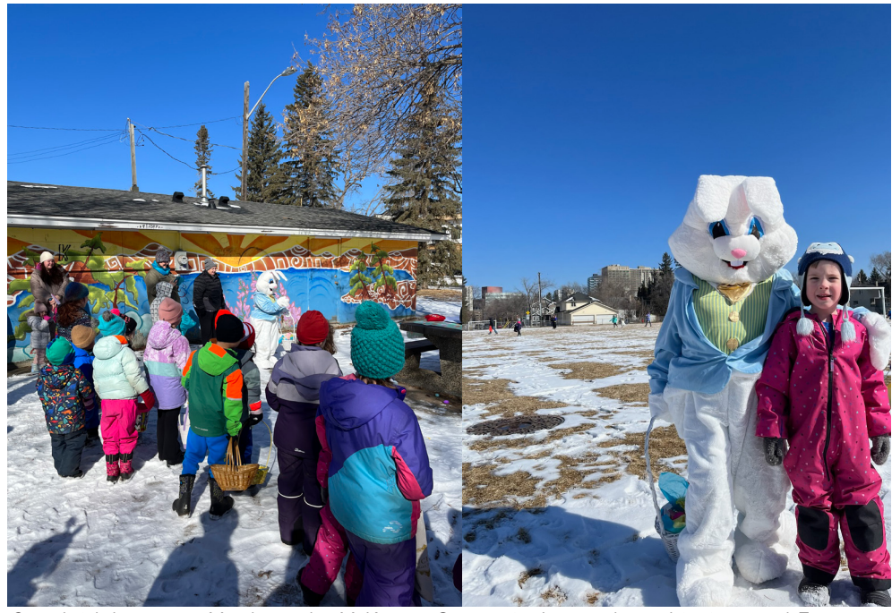
On a brisk but sunny March 30 the McKernan Community League hosted its inaugural Easter egg hunt. The event was very well-attended, with dozens of children searching for eggs and candy in the McKernan School field and around the community hall.